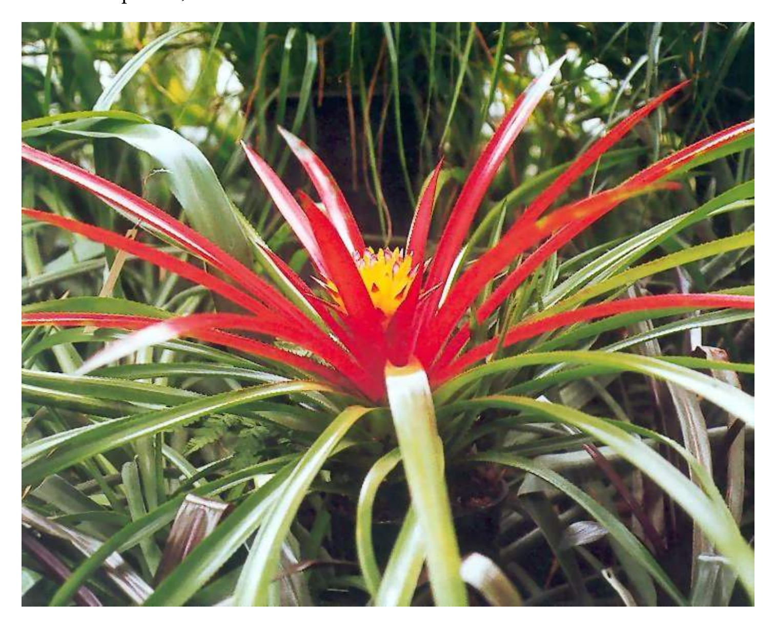
Aechmea biflora, formerly Streptocalyx biflorus.

I was curious about this statement that "petal appendages have proven unacceptable as a delimiting generic character" in certain cases. Proven is a pretty strong word in botany. How could someone prove it anyway? Or did some botanist just decide that this feature wasn't so important, and others followed.