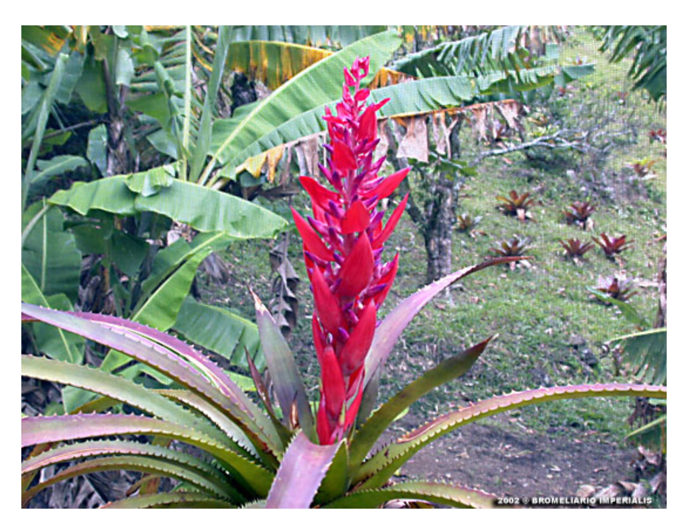
Aechmea vallerandii

More on the Taxonomic Process. Streptocalyx , which was created by Beer in 1856, may well have been the first genus to be created based on the lack of an appendage. Over the next century, more genera were recognized more or less solely due to the lack of an appendage. Was there sort of a domino effect - if the absence is critical to distinguish A and B, then it is also good for C and D, and E and F etc.